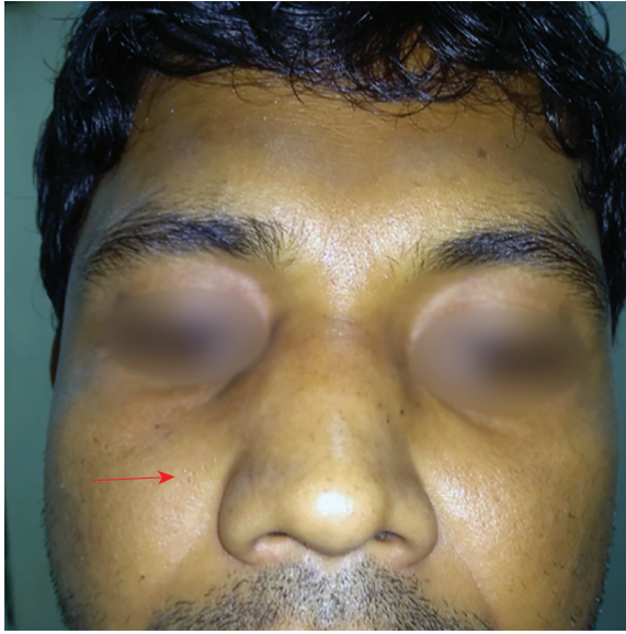
Figure 3: Minimal induration persists even after resolution of swelling, suggestive of residual lesion. Biopsy revealed fungal elements retained in the induration (red arrow).

The treatment was primarily medical, except for six studies where surgical debridement was also performed. 3-5,9,13,14 The medical management