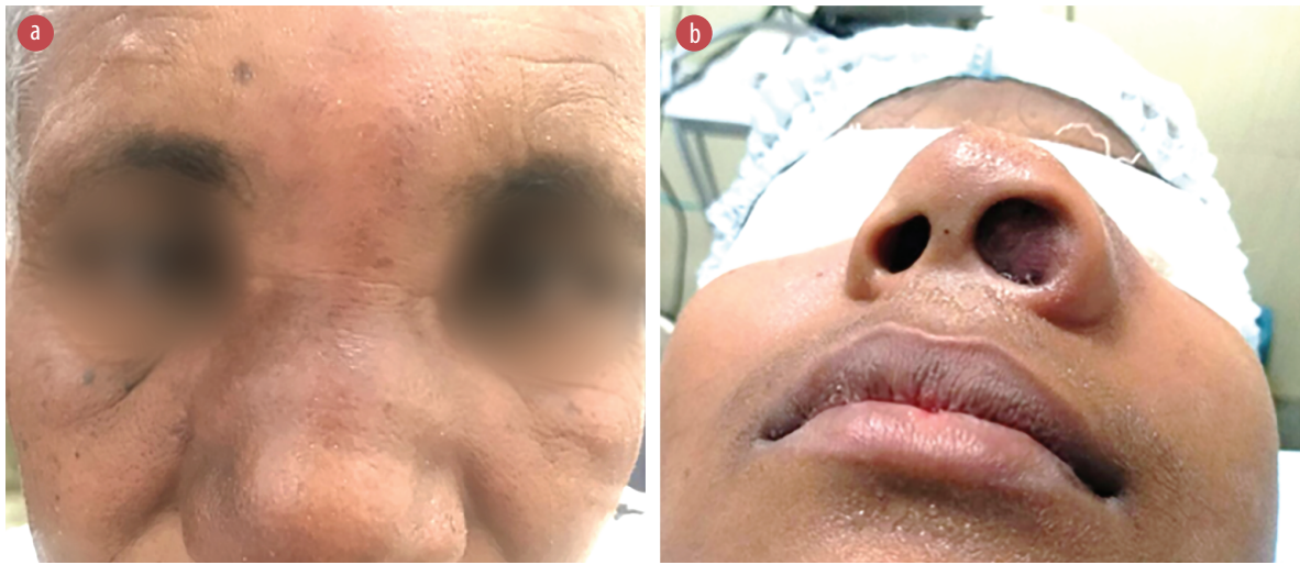
Figure 1: (a) Typical presentations of conidiobolomycosis depicting subcutaneous facial swelling. (b) The characteristic nasal obstruction decreased sensation over the area of swelling. The induration typically extended beyond the swelling.

KI: potassium iodide; FESS: functional endoscopic sinus surgery.